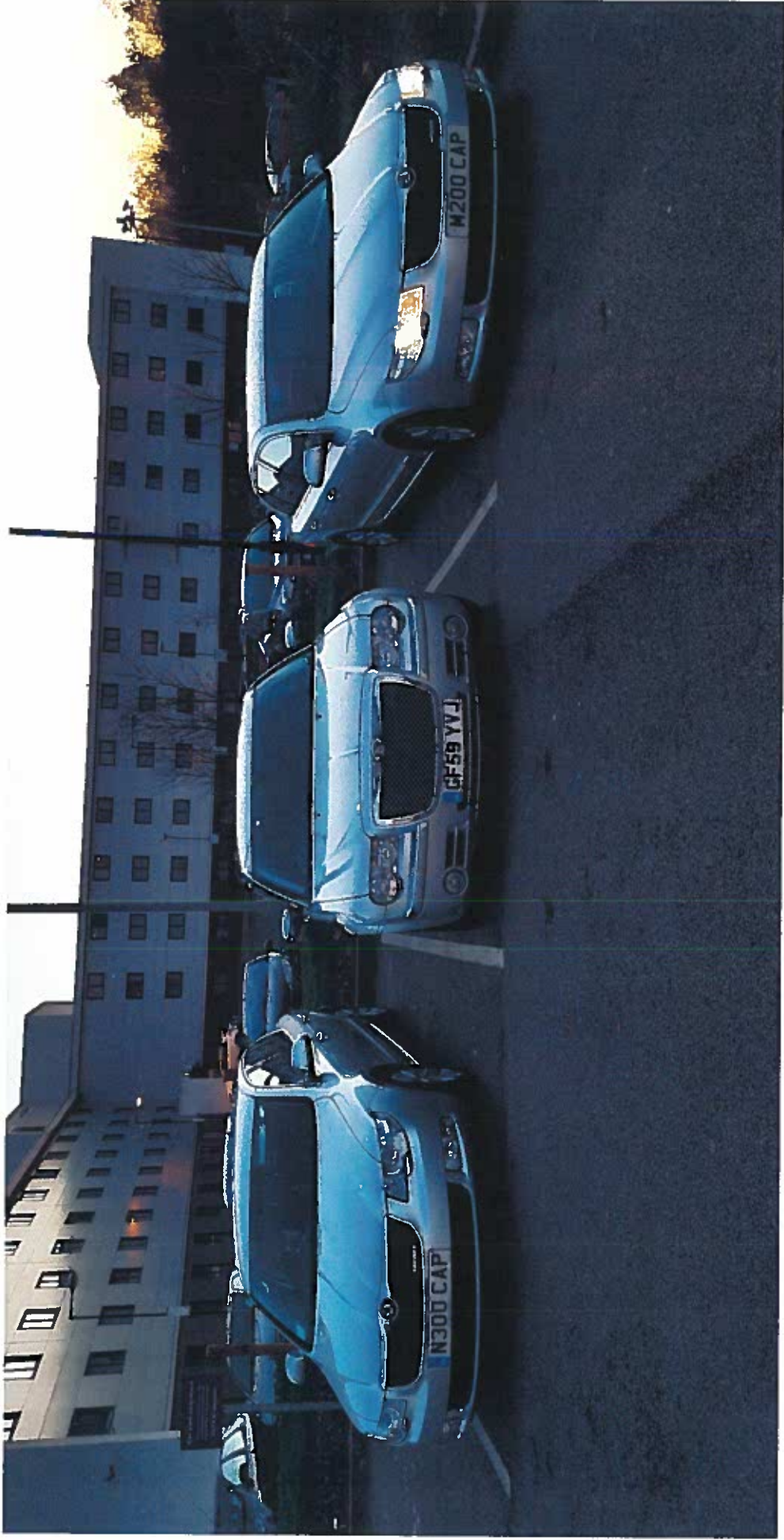
Silver Service Fleet of Vehicles